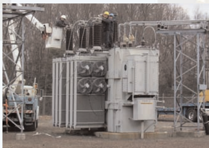
A new main power transformer is delivered and installed at the PINESHED substation.